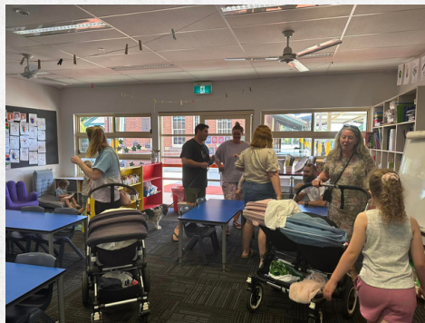
Parents and staff catching up