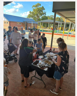
Sausages were a big hit