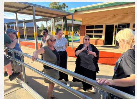
Meeting new staff members

We recently had our Welcome BBQ at school. It was a great success with most families of the school attending - checking out classrooms, meeting teachers and having a BBQ sausage.