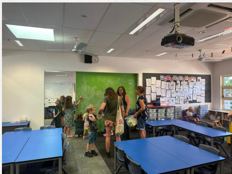
Students keen to show their parents around

We will be looking for volunteers to help out on the day so please contact the school if you would like to be involved.