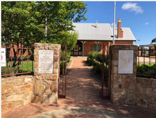
Murchison Primary heritage building ready to help the school celebrate 150+ years!

Murchison Primary School's 150th celebration is happening on Saturday, 1st April and let's hope it's third time lucky. There will be food and drinks, games and entertainment and a chance to look back through photos and other memorabilia. We are excited to invite the community to this long awaited event.