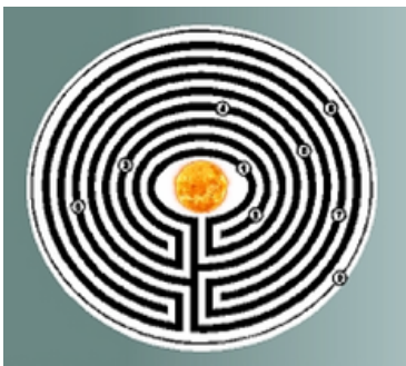
An outline of the pathway of the Murchison Meteorite Labyrinth

Stage 1 of the labyrinth was officially opened in 2019 as part of the 50th anniversary celebrating the fall of the Murchison Meteorite. With Stage 2 being recently completed, new features show the updated pathway, together with the planets of the solar system painted by Murchison Primary School students. The planets are all positioned to correspond with the time the Murchison Meteorite landed in the Murchison district on 28th September 1969. A board beside the new plaque gives information about the labyrinth, as well as naming and identifying each planet.